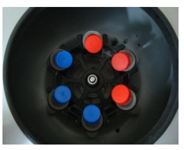
Figure 10. Centrifuge