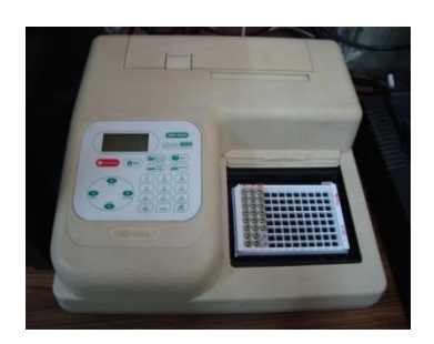
Figure 11. Microplate

Serum hsCRP levels- evaluated by immunoturbidity method (private laboratory).