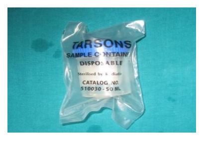
Figure 5. Saliva Sample