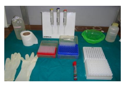
Figure 8. Armamentarium used for Blood sample collection