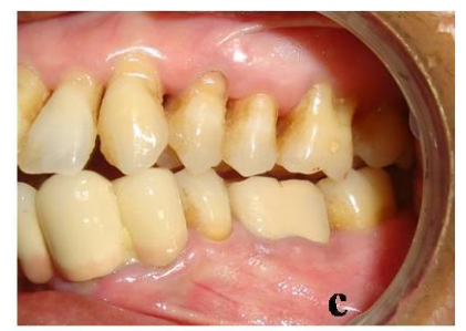
Figure 3. a- months after periodontal surgery, probing depth in 36 was reduced to 3mm; b- Prior to placement of PFM in 36; c- 24months following placement of PFM in 36